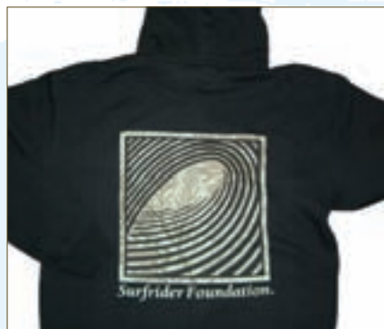
BLACK ICON SWEATSHIRT zip-hooded black sweatshirt S-XXL $45